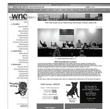
All New Web Site: www.wncla.org