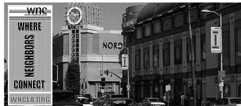
Street Lamp FlagS