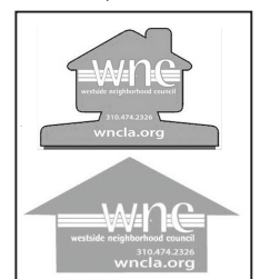
Computer Screen Sweeps and Magnets