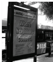
Bus Stop Posters